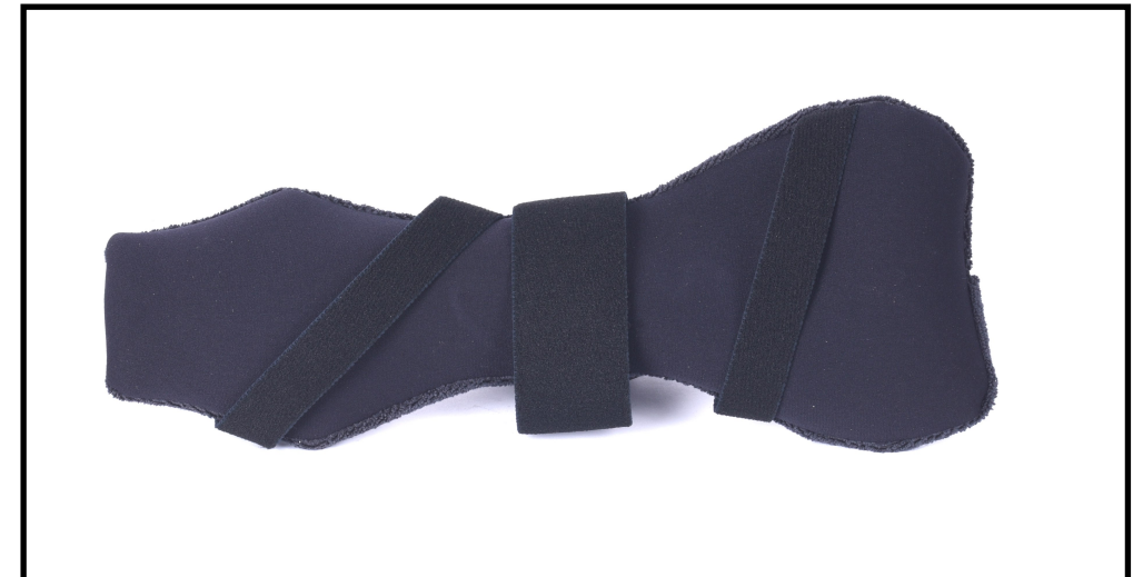
Replacement Forearm Cover and Straps (Thumb strap and extra finger strap not pictured)

The replacement belt pads come in a set of 4 pads that can be machine washed or replaced when worn out. Please connect any Velcro parts, wash in cold water, gentle cycle and tumble dry on low heat. The 2 hip pads slip over the corresponding hip templates on the core belt. The back pad is identified by the long Velcro strip. It is placed around the overlapping belt parts and button snaps in the back with the longer flap closing upward to connect with the shorter flap. The front pad is placed behind the strap with with ratchet buckle while the belt is open and the Velcro tab is closed around the belt to keep it from falling off. When it is time to close the belt the ratchet strap goes into the ratchet buckle while the plastic belt slides into the pocket of the front belt pad. Please be sure the padded aspect for each pad is on the inside where it will protect the skin and provide comfort.